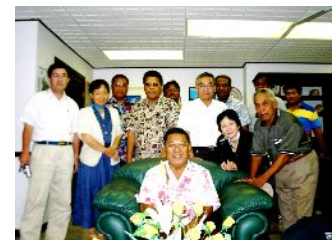
Vice-Governor, closing the planning conference