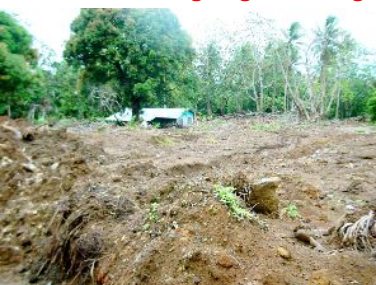
The massive human and crop damage