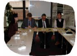
The scene at the 3rd annual general meeting