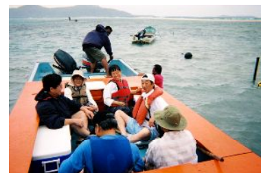
On the boat investigating the damaged area

Disaster relief will firstly come in the form of rice. After that we will switch to agricultural aid. The money from our fund raising campaign will be used for the above projects and to support one agricultural research student each year. We will also contribute to vital road repairs.