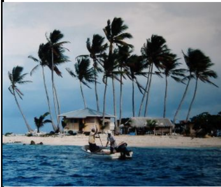
Jeep Island within the Chuuk coral atoll

I came to know the beauty of the FSM and warmth of its people through my Camera. There are many reasons why I became fascinated by this country. But if I were to pick one, my first visit five years ago stands out most vividly. We arrived at Chuuk airport at night. On our way to the Blue Lagoon Hotel from the airport, the stark light bulbs hanging from the coconut trees along the road emphasized the deep darkness spreading behind them. I felt uneasy in spite of being told before the trip that local people were friendly. However, next morning, when I opened the curtains in my hotel room, I was welcomed by a view that could have been from a scene in a movie: emerald green sea, blue sky... nature's treasure house. Meeting local people reminded me what is important in life. They gave me richness of the heart and spirit. I would like to join the activities of AMD and do what I can for those people