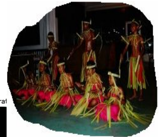
Traditional Dance