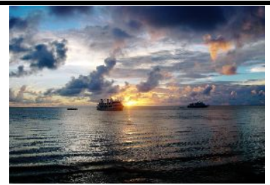
The evening sun on Momen Island in the Truk archipelago

It has been a great experience and a great privilege for me to be associated with the Federated States of Micronesia through AMD. I have long been interested in the fascinating history of this region, but until five years ago I had not had the opportunity to visit any Pacific Island country. The experience was extremely rewarding. The warmth of the people and the beauty of the islands, each unique in some way, and the stunning colours of the seas and the reefs was beyond my expectations. Also, I was surprised that there is a strong natural affinity with Japan that is partly due to history, but also partly to do with the underlying culture of Micronesia. It seems natural that Japan should develop closer relations with the FSM. I think that we in the AMD must work hard to make sure that this happens and that the relationship enriches the lives of the people of the FSM.